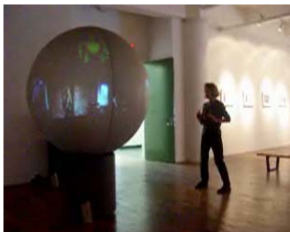
Figure 7: ANIMA plays on the Globe: the performance is divided into character sets, each character's story being told from one side panel, with the avatars and morphing creatures swirling around the top of the sphere