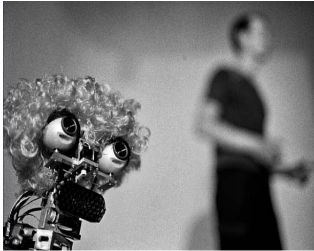
Figure 3: Media Lab Europe's "JoeRobot" in 'her' first transformation to Josephine, in the Flutterfugue performance with SmartLab and NYU CATLab: London, July 2002

could build a perfect robot reproduction of man or woman, what would it do? It could in fact only do what we can do, no more, and no less. The addition (or subtraction) of any attribute not pertaining to our human form and function results in a deviation from the original holy grail. Consequently, such a robot could “only” replace us and the fear of robots taking over the world becomes real.